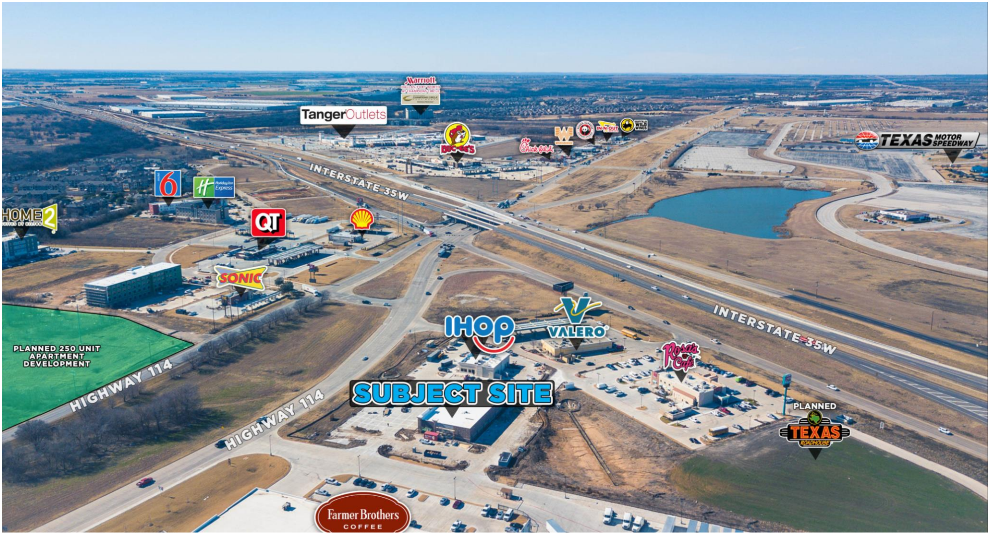
Aerial Northlake, TX