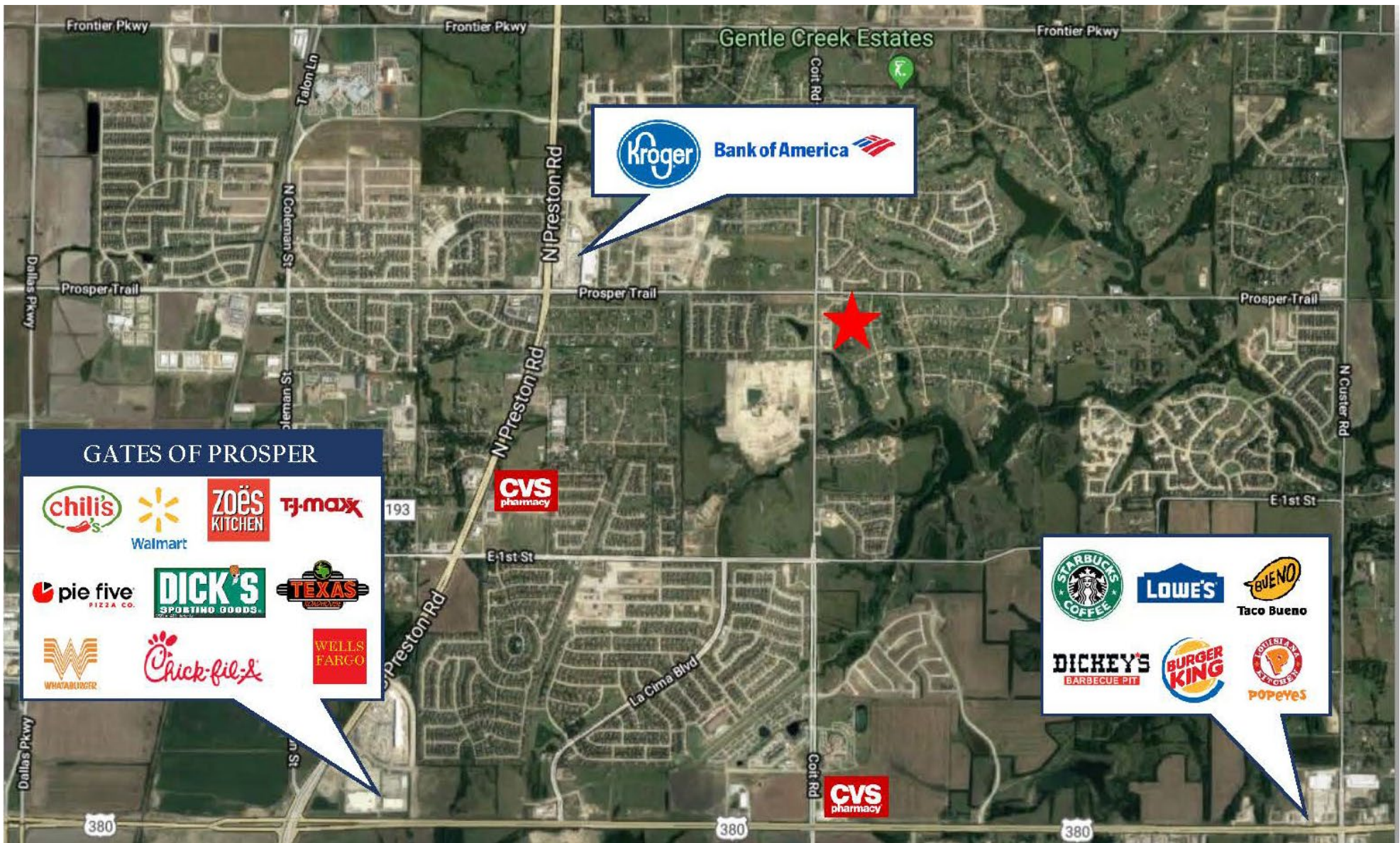
Aerial Prosper, TX