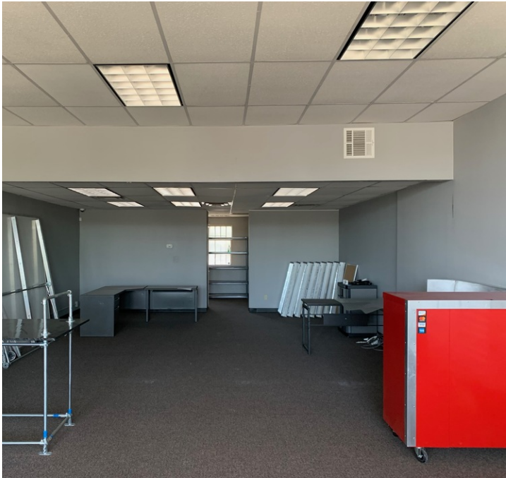
5009 Menaul - 1,212 SF