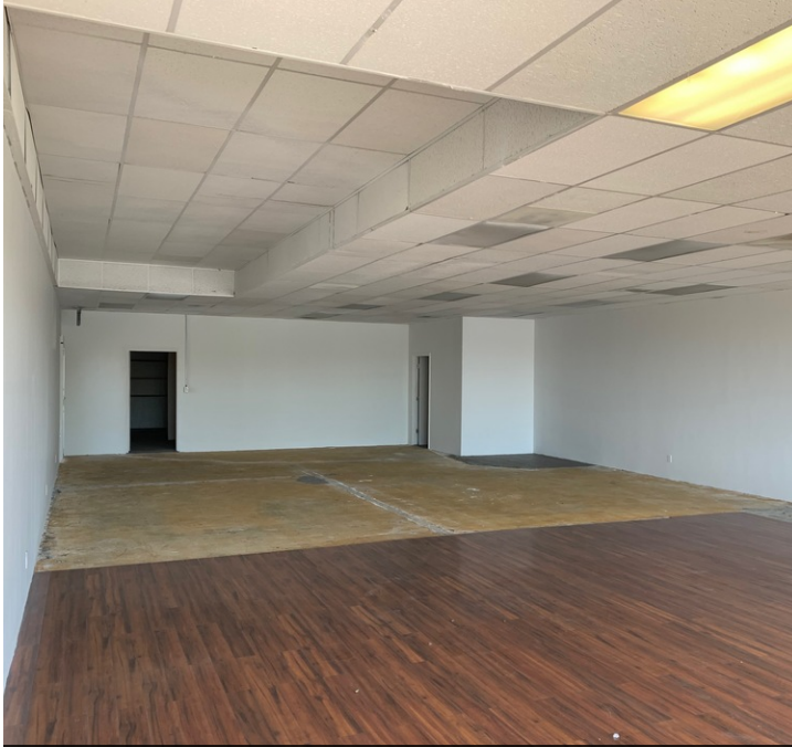
5001 Menaul - 2,667 SF

NWQ OF MENAUL BLVD AND SAN MATEO BLVD 5001-5023 MENAUL BLVD NE ALBUQUERQUE, NM 87110