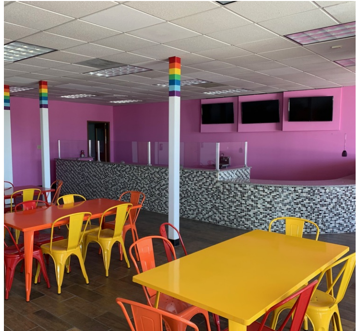
5015 Menaul - 1,950 SF

Daniel Kearney dkearney@resolutre.com 505.337.0777