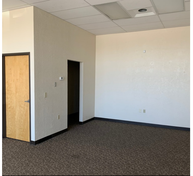
5005 Menaul - 971 SF