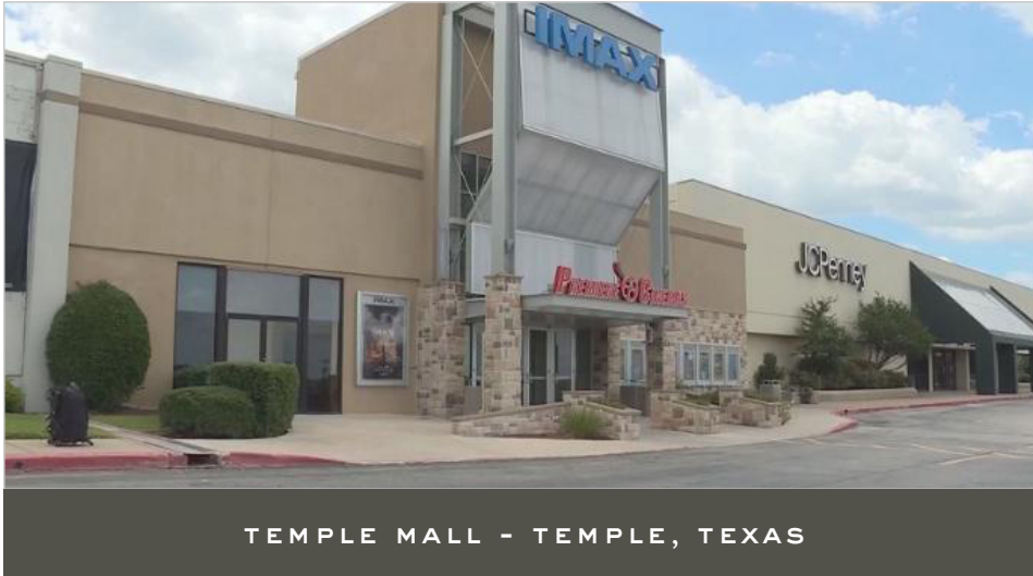
TEMPLE MALL - TEMPLE, TEXAS

3111 SOUTH 31ST STREET - TEMPLE, TX 76502