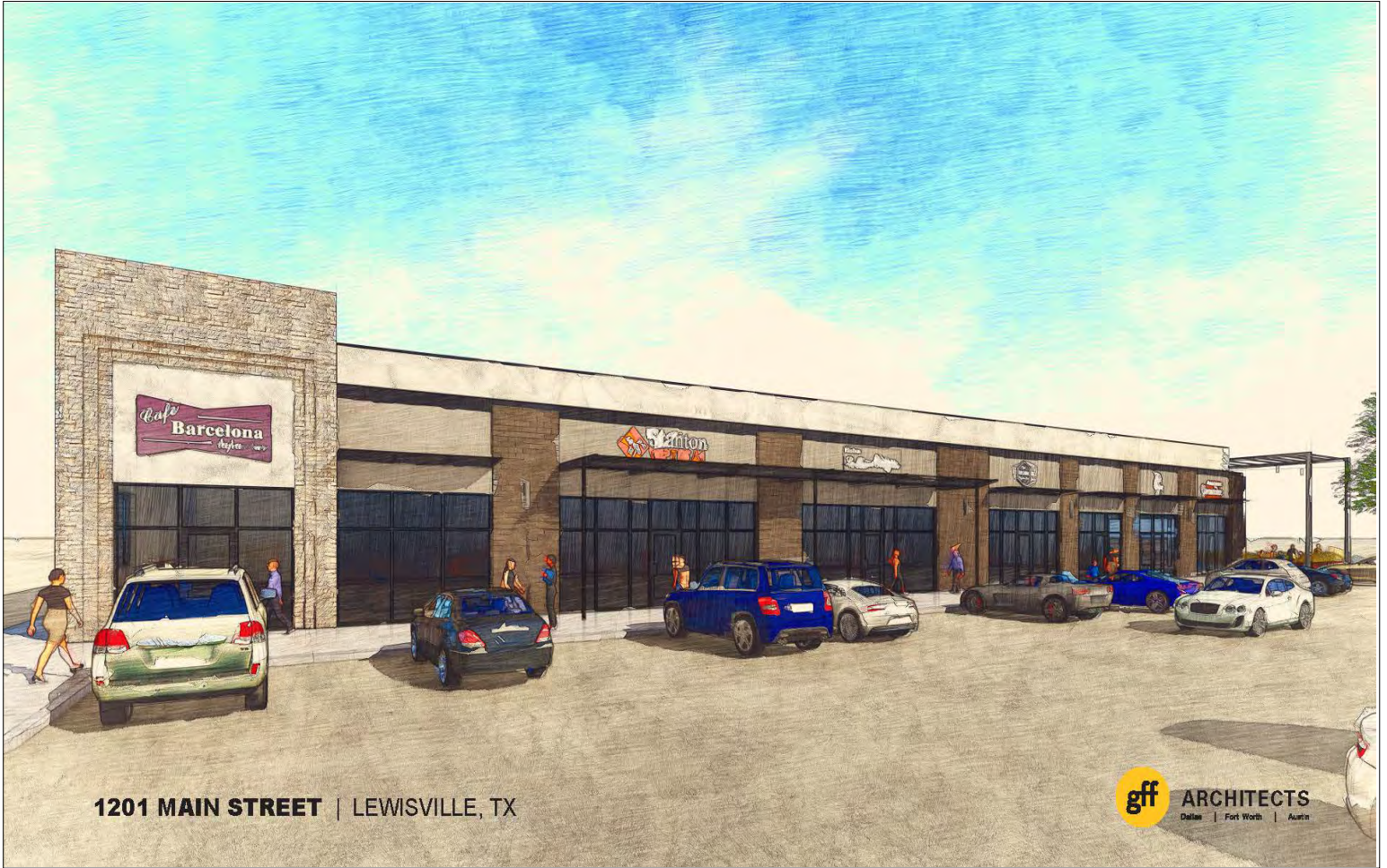
1201 MAIN STREET | LEWISVILLE, TX