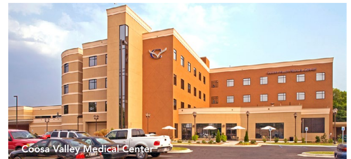
Coosa Valley Medical Center

The information contained herein has been obtained from sources deemed reliable, however, HRS makes no guarantees, warranties or representation as to its completeness or accuracy thereof. The presentation of this property is submitted as proposed subject to errors, omissions, change of price or conditions, prior to sale or lease or withdrawal without notice. Need not be built.